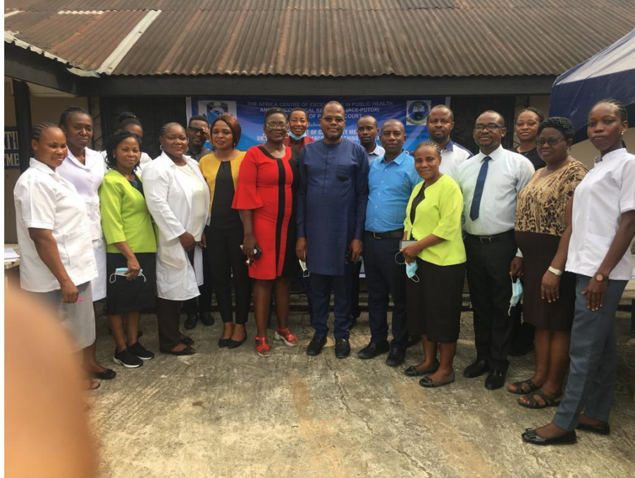
Figure 11: ACE-PUTOR leader with members of staff of PHC Aluu