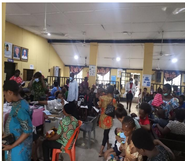
Figure 9: Clients for the health outreach