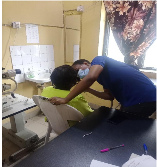
Figure 6: Eye examination for a client