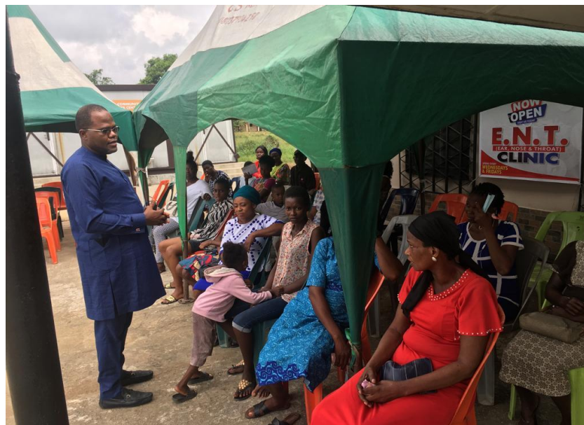
Figure 2: ACE-PUTOR center leader declaring the outreach open

The outreach had the following services: