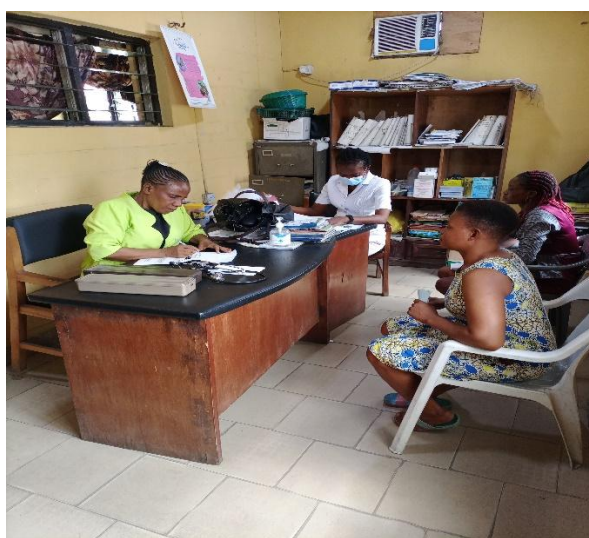
Figure 10: Family planning counselling ongoing