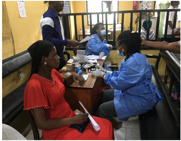
Figure 4: Laboratory tests for clients