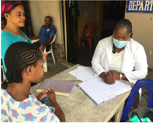
Figure 3: Doctor attending to clients