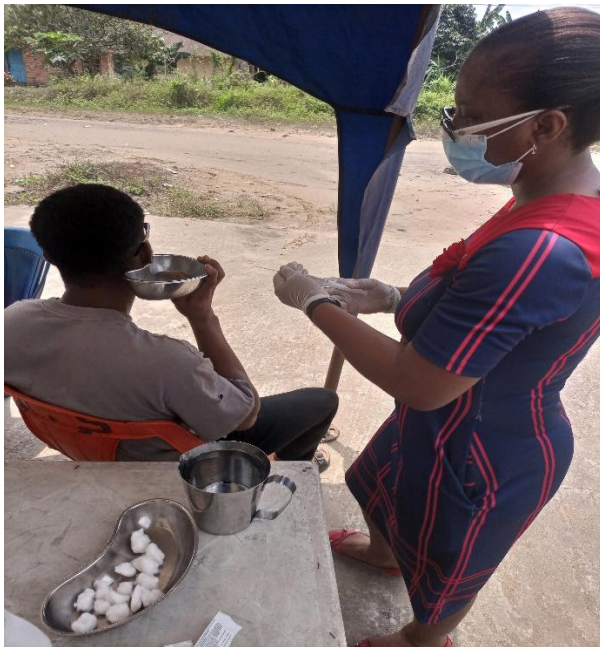
Figure 5: Ear syringing being done for a patient